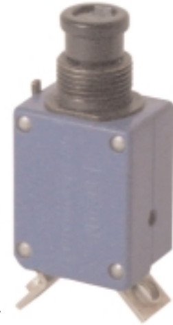
2TC49 "Dual Safety" Circuit Breaker